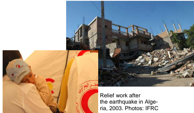
Relief work after the earthquake in Algeria, 2003.

Denmark in 2000, in which 9 people were killed and numerous wounded as a result of sudden chaos during the concert. She clearly demonstrated the volunteers' need for psychological support, as well as the necessity to have a good co-operation between professionals and volunteers.