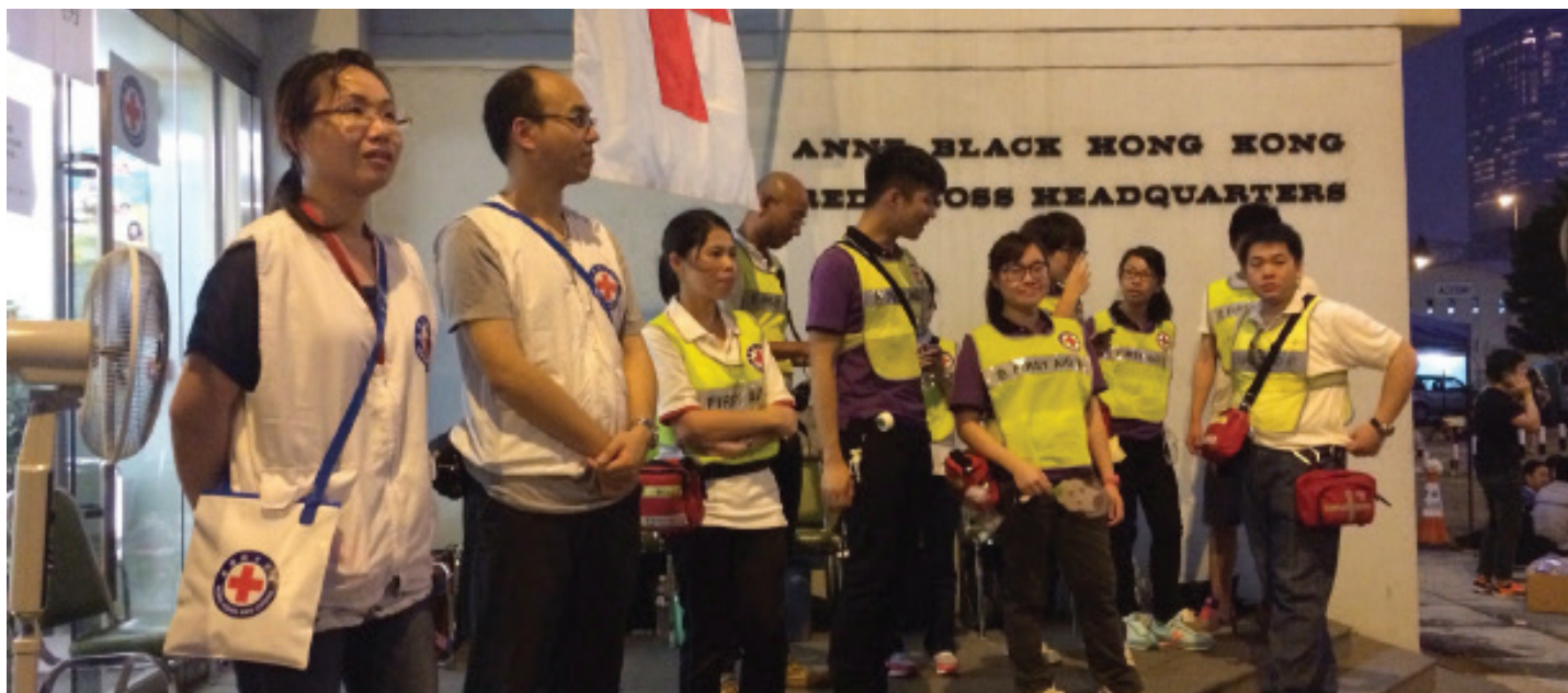
At left: Protestors gathered right in front of the premises of the Hong Kong Red Cross Headquarters. Top right: Volunteers of the Psychological Support team provided psychological first aid to the injured and scared, including through telephone hotline services. The Psychological Support team worked around the clock, partnering with the first aid team, pictured above.

station in HKRC headquarters or through the hotline. Out of the 439 callers to the hotline, 135 were referred to our clinical psychologists. At the time of this report, how the situation will develop is still unknown. But it is certain that HKRC is always ready to serve those in need, and hopefully people will continue to turn to HKRC for safeguarding of the principles of humanity and neutrality, and not merely because our building is located right at the core of the eye of storm.