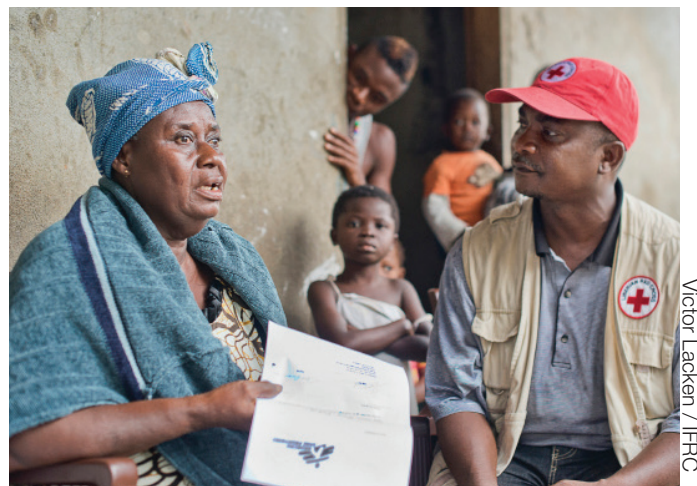
Victor Laeken / IFRC

In some cases, local customs may be interrupted or adversely affected by an epidemic. For example, in cultures where it is customary to touch or kiss a deceased person as a symbol of final parting, such practices must not be allowed when the