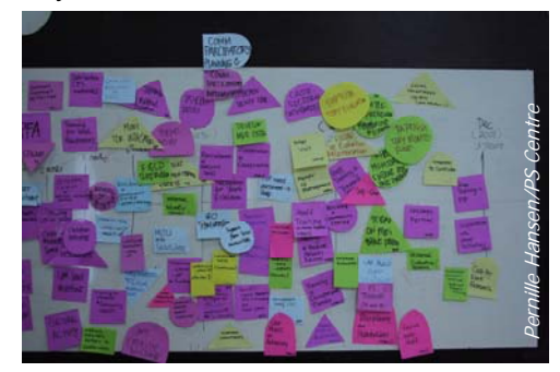
A completed day's work at the workshop showing the VIPP cards used.

this rich conglomeration of information to consolidate prioritised best practises and recommendations.