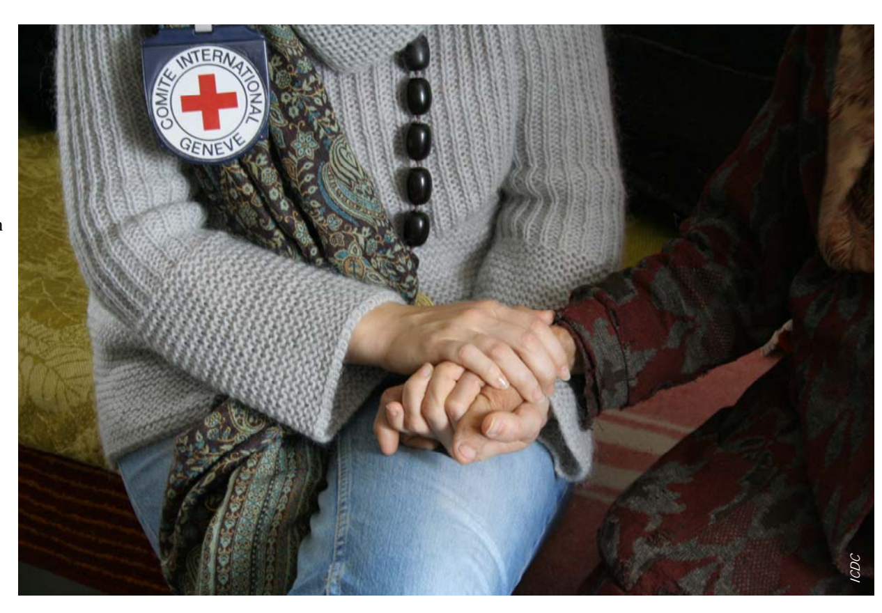
Woman being councelled by ICRC delegate.

Acknowledgment of the long-lasting psychological impact of armed conflict took hold in the early 1980s with the publication of diagnostic criteria for posttraumatic stress disorder by the American Psychiatric Association in its Diagnostic and Statistical Manual, Version IV (DSM III). The criteria highlighted the negative impact of external events on the mental health of individuals.