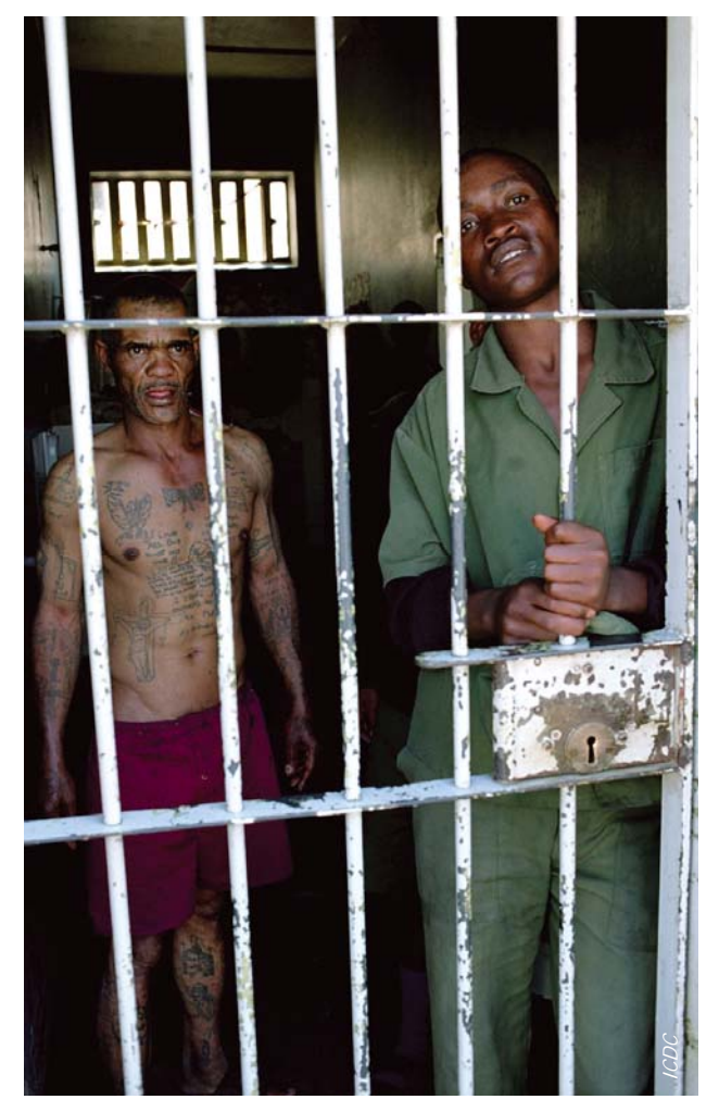
Living conditions in most of the world's prisons are unhealthy.

An essential part of the specific public health context of prison settings is improving access to care and building