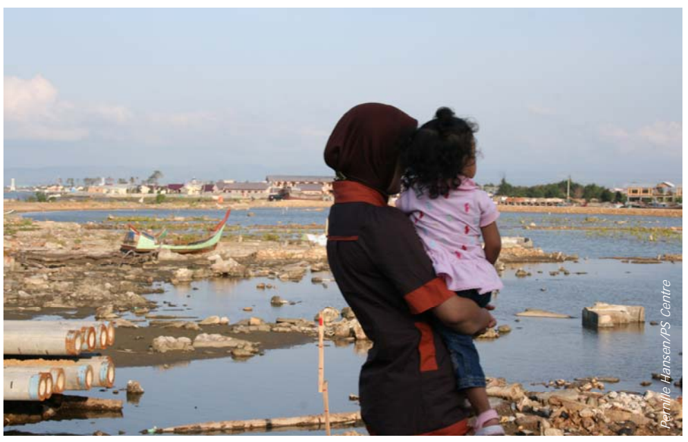
A mother and her child looking out over the river leading into Banda Aceh that is still full of debris from following the devastation of the Tsunami.

It is always an invaluable experience to share lessons learned in a forum with others working in the same field. Not only does it give participants a unique