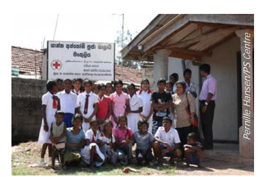
Community members next to a community center in Galle, Sri Lanka.