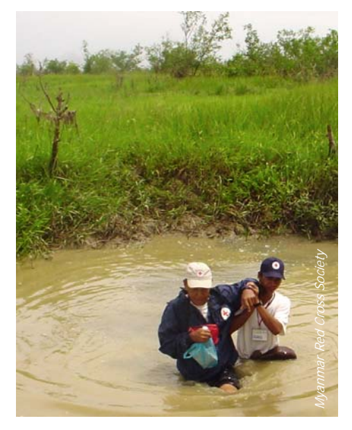
Psychosocial volunteers of the MRCD volunteers trying to reach villages in Bogale Township.

felt until the early stages of recovery. However, assessment reports from