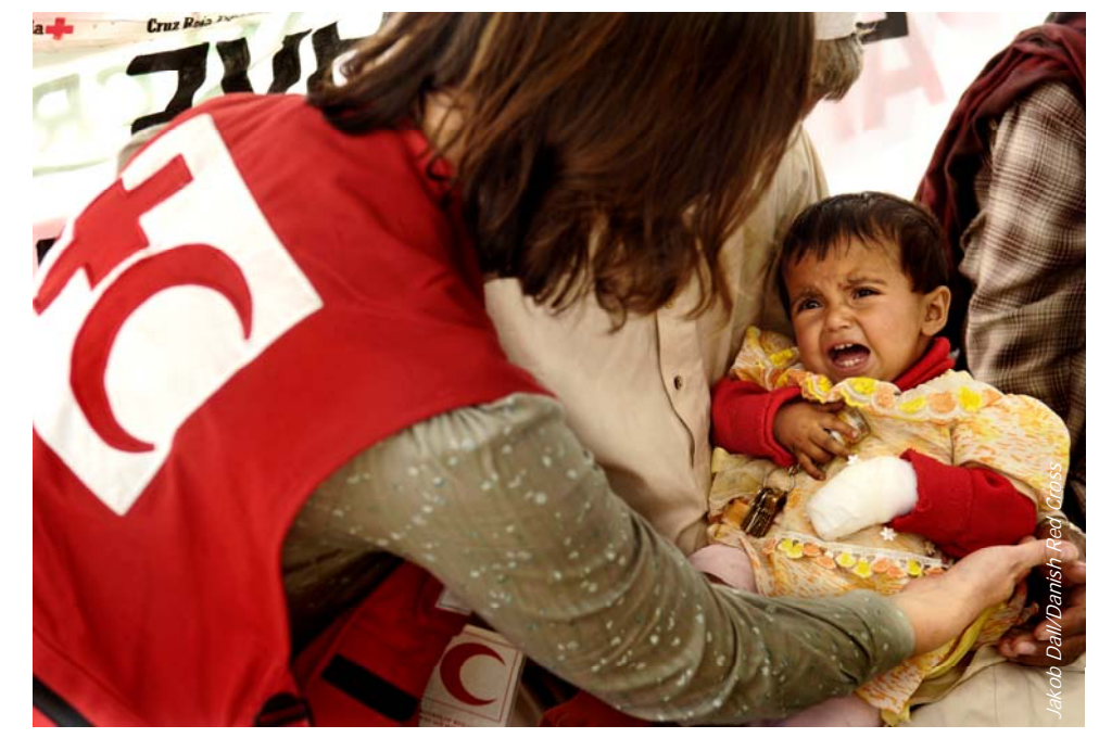
Working in a humanitarian context has a significant potential to be stressful. In the photo we see a International Federation worker responding during the 2006 Pakistan earthquake.

incidents. CISM refers to a comprehensive, systematic and integrated multi-component crisis intervention package, which enables individuals and groups to receive assessment of need, practical support and follow up following exposure to traumatic events in the workplace. Therefore, CISM programmes should comprise of pre-crisis education,