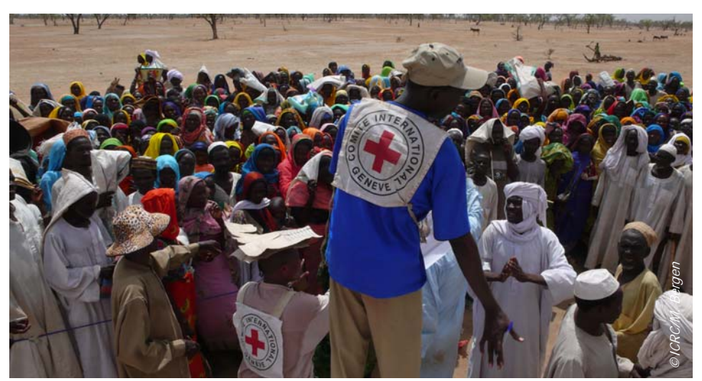
The IASC task force on mental health and psychosocial support in emergency settings has emphasised the need for care of staff members working in emergency settings. In the photo, the ICRC distributes aid to the displaced population in Eastern Chad.

sound early intervention studies, containing detailed descriptions of training and fidelity checks on interventions used'9. Therefore, CISM and PD are used primarily as an organisational support cohesion strategy in many organisations and not as a preventative measure against PTSD. The ICRC peer support programme and training reflect this ethos.