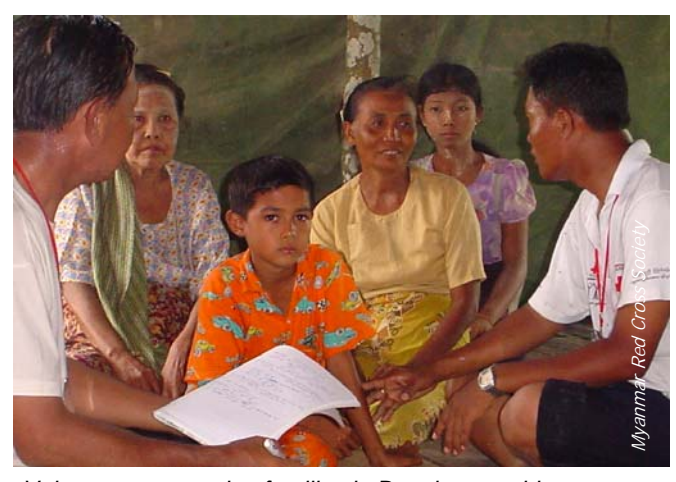
Volunteers supporting families in Bogale township.

From September onwards, Red Cross staff and volunteers will have information and education material to support their psychosocial activities, and more than 40,000 brochures and posters will be distributed throughout the delta. Preparations are underway to distribute 900 psychosocial support community kits and more than 4,000 psychosocial family kits in the near future. Psychosocial support will not only be extended to the affected community - more than 260 Red Cross staff and volunteers will be debriefed by independent professionals at the end of 2008.