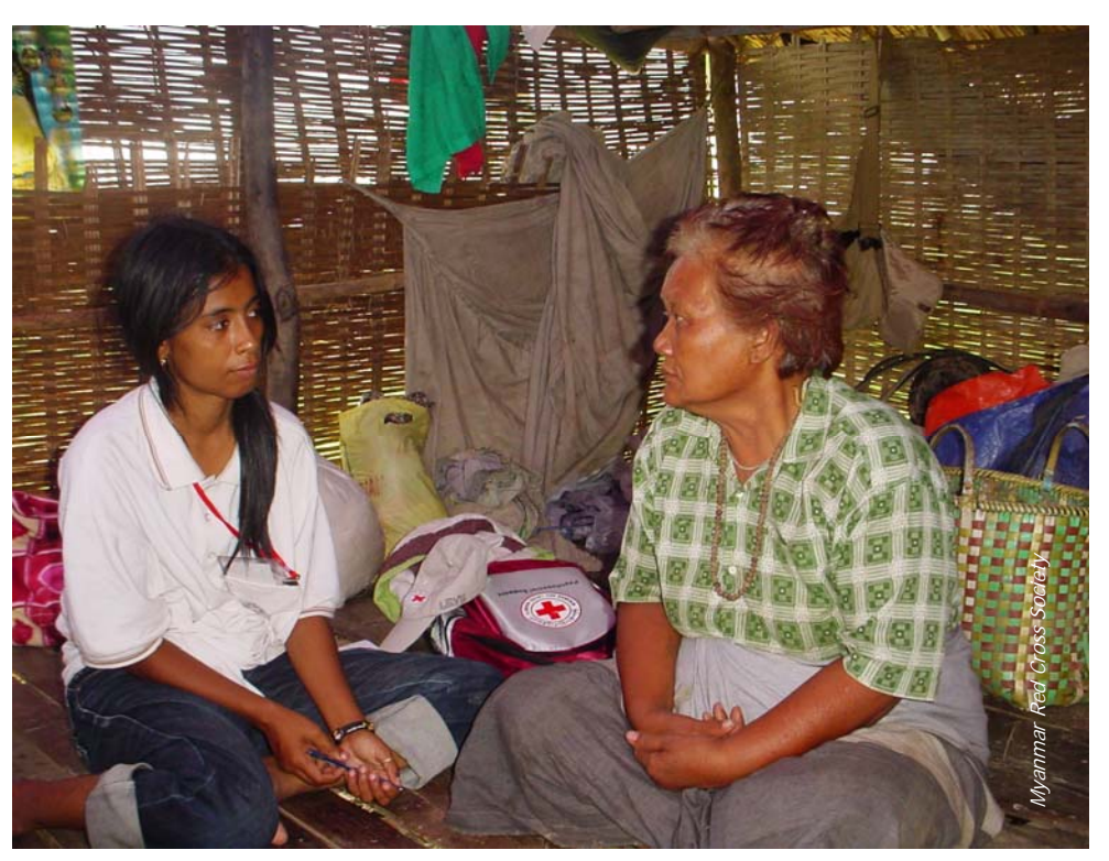
A trained psychosocial support volunteer of the Myanmar Red Cross Society extends psychosocial support to a woman in Bogale Township, July 08.

Three months after the cyclone, the population is still suffering; perhaps now more than ever. According to the PONJA assessment<sup>1</sup>, 65 per cent of the population surveyed reported health problems, and about 80 per cent of respondents indicated that they lived within an hour's walk or boat ride to a health facility. The shortage of supplies, drugs and medical personnel is aggravating the situation. Psychosocial assessments conducted in the field confirm that cyclone survivors are in a fragile psychosocial state for many reasons besides having to survive the cyclone itself. In addition to death separations. secondary separations are emerging as parents and caregivers are sending their